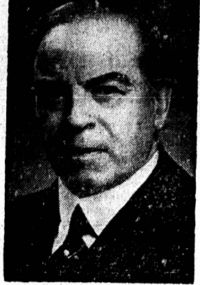
PRIME MINISTER KING, Canada's Greatest Premier of All Time.

Under his guidance Canada has earned the recognition by all the world as the GREATEST nation of them all for its size, as well as for its contributions during this present war. This is the TRUTH —you've got to admit this. Mr. King has earned this great recognition. In spite of all criticisms, he is truly a Great Man. Voters, be honest with yourselves.