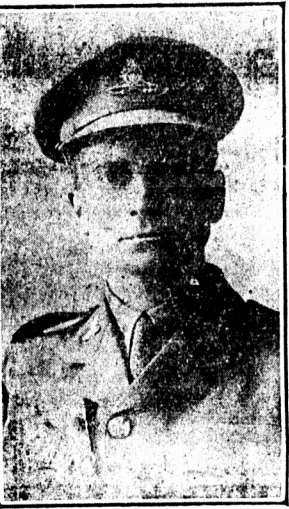
Parliamentary Assistant Minister For Air

Who can replace him today? Has he not earned the right to guide us into Peace? Our Four Island Representatives —three of them went through the crisis with Mr. King; they know him and were by his side through it all.