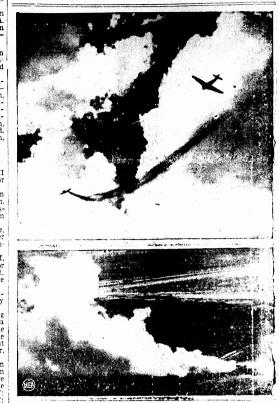
In one of the few photos showing air action by Soviet forces a Russian plane is seen, top left, as it swoops over a German plane on the Kuan river front. The flaming Nazi craft crashed in a cloud of smoke as the 15th enemy plane shot down by Soviet ace Capt. Ivan Gerasimov.