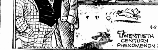
By George McManus