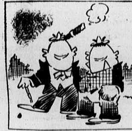
"He made a splendid start with his flying-machine." "Fine—hope he can keep it up."

MORE AMERICAN TOURISTS. Number This Year Will Exceed the 165,000 Who Came Last Year.