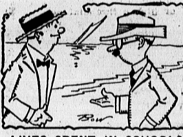
"Whales are very intelligent animals." "Why not? They spend their lives in schools."