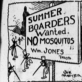
NO, INDEED. Answer Squelco: I'll bet the summer boarders won't think so!