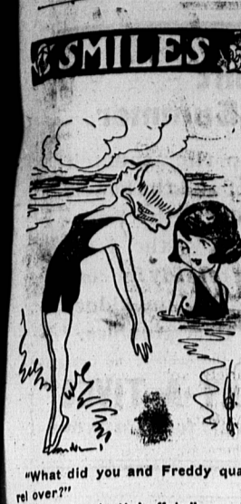
"What did you and Freddy quarrel over?" "Oh, just a 'potty' affair."