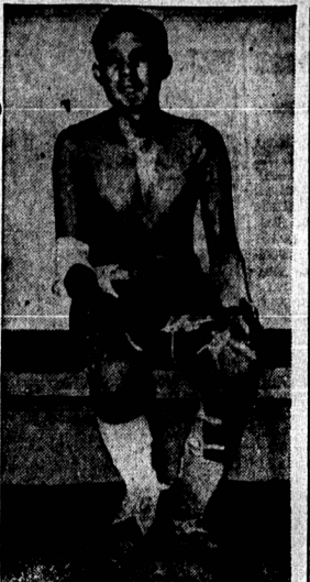
Burned atomic bomb victim above was Japanese prisoner of Japs at Nagasaki.

SOUTHERLY ONLY At the North Pole all winds blow south.