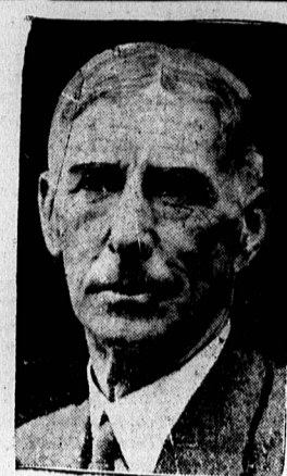
CONNIE MACK Athletic Leader