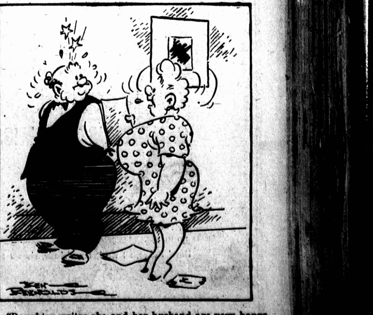
"Daughter writes she and her husband are very happy since they found their new apartment with a Guardian Want Ad—now I must visit them!"