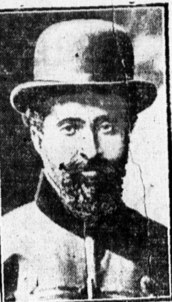
Ras Tafari Mohonnen, ruler of Abyssinia, who claims to be a descendant of the queen of Sheba. He has protested to the League of Nations against the recent Anglo-Italian agreement. Mr. Chamberlain has explained that the terms are subject to the voluntary consent of Abyssinia.

Such are a very few of the considerations which show that for every type of animal there is an optimum size. And just as there is a best size for every animal, so the same is true for every human institution. In the Greek type of democracy all the citizens could listen to a series of orators and vote directly on