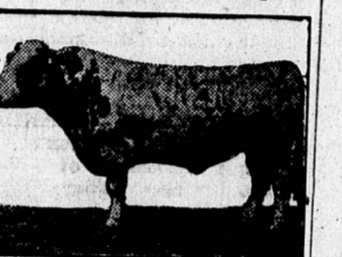
The Tried and Proven Bull is the Best Investment.

Breeding furnishes the most economical way to obtain large-producing cows. The pure-bred bull, with generations of high-producing ancestors back of him, must be used for breeding, and only the best heifers from the best cows should be chosen to be the dams of the next generation. Pure breeding alone does not make a good sire. The pure-bred sire should come from a long line of high-producing ancestors. If an old bull is selected he should have high-producing daughters. Two courses are open to the dairyman when buying a herd bull; he can purchase a young bull