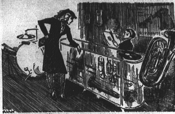
"Have you the score of the Arcadians?" "Only the half-time scores up to now mls. Who are they playing?" —Humorist.