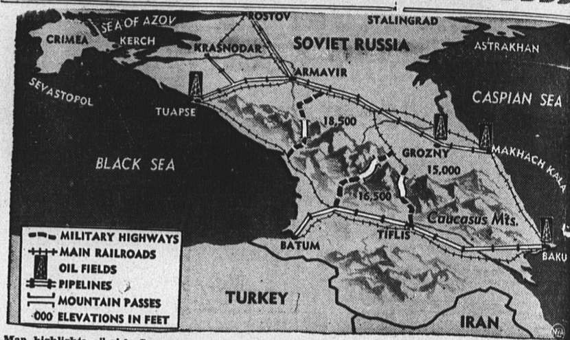
Map highlights oil-rich Caucasus region of Russia, believed the ultimate goal of Germany's preliminary attacks in the Crimea eastward on the Kerch peninsula.