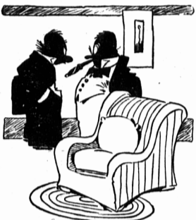
NOT ENOUGH IN THE FIRE

1st Politician: Does the senator put enough fire in his speeches? 2nd Politician: Oh, yes; but not enough speeches in the fire.