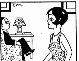
REQUIRED SOME SLEEP

1st Politician: Does the senator put enough fire in his speeches? 2nd Politician: Oh, yes; but not enough speeches in the fire.