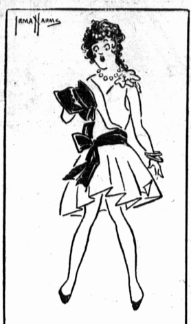
"When the dough has been shortened a roll is bound to be light."