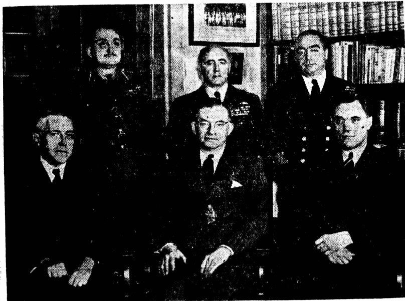
Pictured above is the first official photograph of Hon. Brooke Claxton, Minister of National Defence, with the chiefs of the three armed services and the Director-General of Defence Research. The men above are responsible for guiding the destiny of Canada's Armed Services and research during the post-war years. To them lies the task of co-ordinating the three services into a smooth-running machine and to keep abreast of developments in the field of research whereby