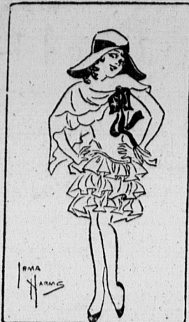
"A girl generally looks coolest when she's all ruffled up."