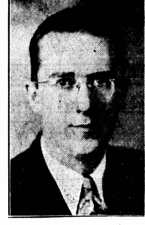
Hon. F. A. Large, K.C. Minister of Education