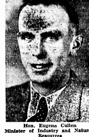
Hon. Eugene Cullen Minister of Industry and Natural Resources