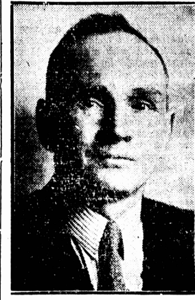
Hon. C. C. Baker Minister of Agriculture