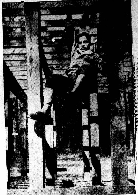
IT'S A CINCH—Swinging through obstacle course at Air Force basic training center, Greensboro, N. C., is easy going for Pfc. Sabu Dastagir, erstwhile Sabu, the Elephant Boy of movie land. He's training for duty with air combat crew.