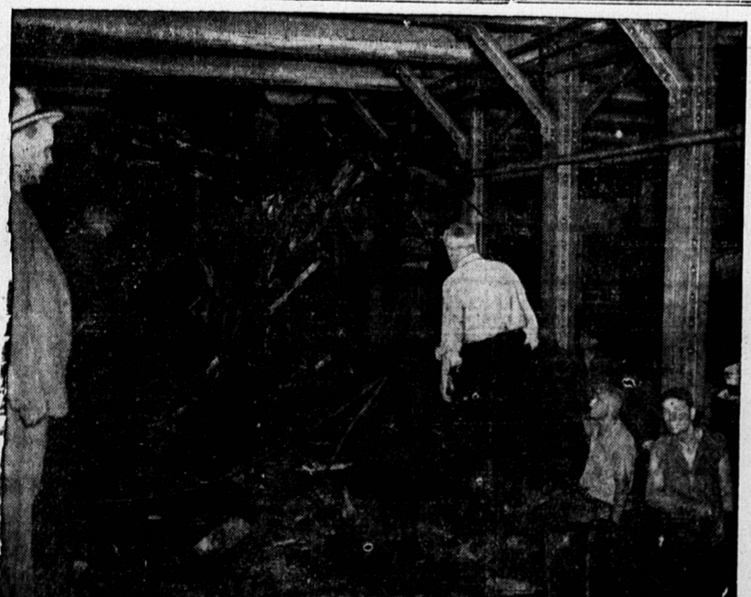
Two people were killed and 49 injured when a subway train ploughed into the rear end of another train at Lexington avenue and 116th street. Work men are here seen trying strenuously to clear away