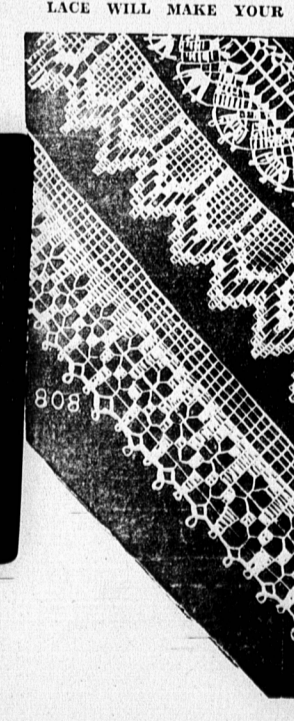
DESIGN NO. 808

If you have ever held a crochet hook you will not be able to resist these simple crochet lace designs for edgings on pillow slips and guest towels.