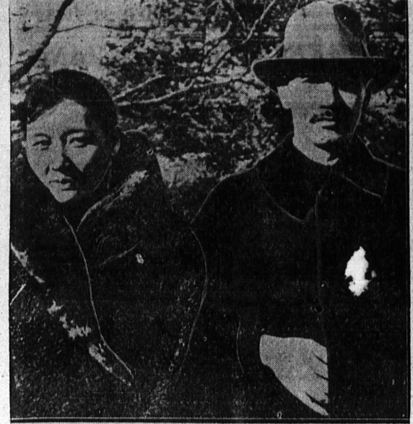
General Chiang Kai-Shek, commander-in-chief of the Chinese national forces, and premier of the regime's new central government, is faced with a move for semi-autonomy in the North China provinces of Chahar and Hopei. He is pictured in a recent informal pose with his wife, the former Mel-Long Soong, graduate of an American college. Kai-Shek maintains a friendly attitude toward Japan.