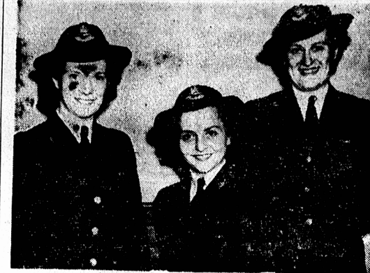
These smiling R.C.A.F. Nursing Sisters are new arrivals in England and the above group are three of the six who took a special course in Air Evacuation work in the United States.

HOUSEHOLD SCRAPBOOK. Rubber Overshoes. The gloss on rubber overshoes is made by the use of a special rubber varnish which is applied before the shoes are vulcanized.