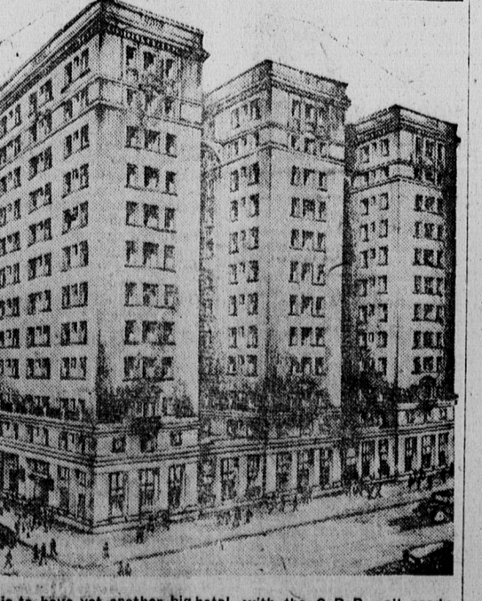
Toronto is to have yet another big hotel, with the C.P.R. all ready to start their big new structure in the fall and the C.N.R. also proceeding with plans, an announcement was made this week that one of the new Ford chain is to be built at once, a 15-story, 750-room hotel to cost $2,000,000. ABOVE in an architect's drawing of the new Ford hotel to be located at the northeast corner of Bay and Dun Street.