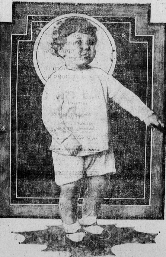
A Balkan prince who isn't thinking of the war cloud is Prince Peter of Jugo-Slavia, son of Prince Paul of Jugo-Slavia and Princess Olga of Greece.