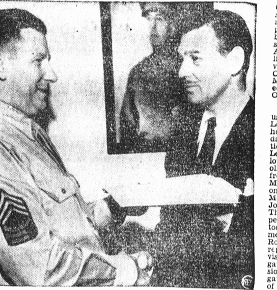
LOS ANGELES, CAL.—The idol of thousands of feminine movie fans, dark haired, 41-year-old Clark Gable, joined the Army, as a Buck private.