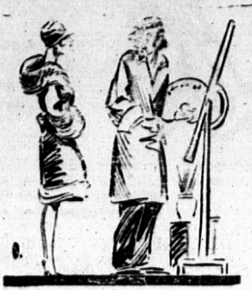
HASN'T LEARNED YET "Is there much money in art?" "I haven't been able to find out. Every time I try to sell a picture it seems like everybody's broke."