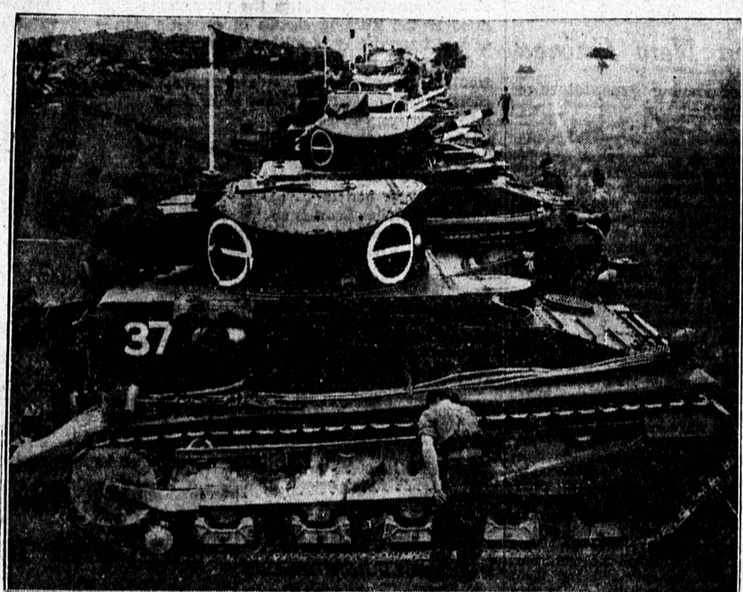
A group of tanks photographed at Tidworth, England, as five battalions of them are assembled in preparation for extensive manoeuvres to be held at Penham Down.