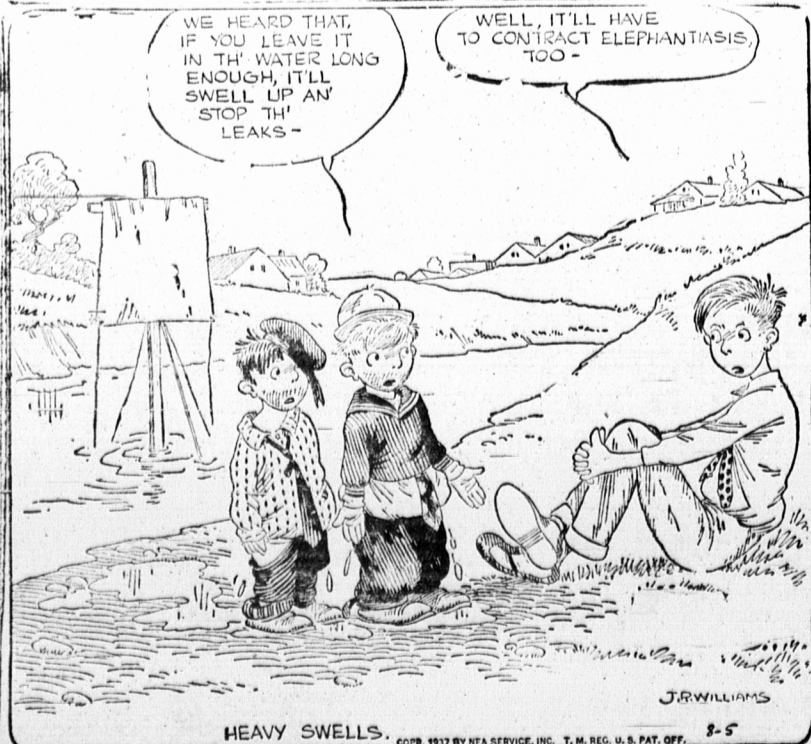
HEAVY SWELLS. 8-5