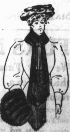
$4.00 to $10.00

Sample selections cheerfully sent on your say-so Fur Caps, Muffs, Collars, Sleigh Robes, Men's Fur Coats in a large variety.