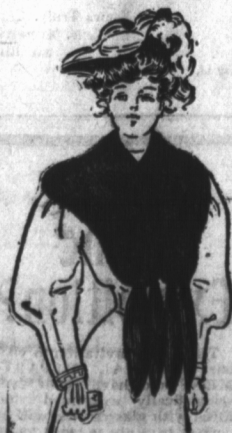
$8.00 to $12.00