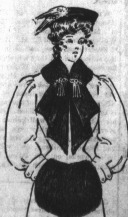
$5.00 to $10.00

$5000.00 Worth of Furs to Choose From 200 American, English and German Ladies' Jacket $2.00, 3.00, 4.50, 5.50, 6.00, 8.00, 10.00, 13.00 and $14.00