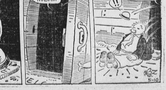
By George McManus