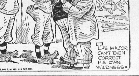
By George McManus