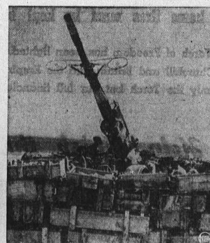
AID FROM THE ENEMY—Italian ammunition boxes filled with stones make a "for" for this British anti-aircraft crew. They're a desert outpost of Tobruk defenses.