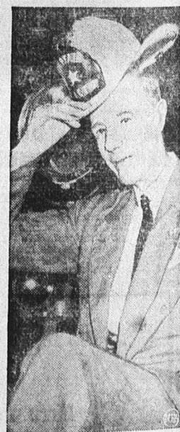
Proving photogenic as New York's little mayor, tall Lord Halifax, the British ambassador, does a La Guardia with fireman's helmet while visiting Washington station with British fire fighters.