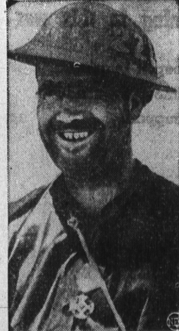
"DECORATED"—This grinning Britisher awarded himself a decoration—the Iron Cross he wears. Late owner won't need it.