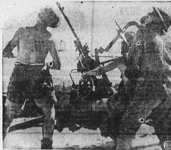
SKY-WRITERS—Writing a pattern of death in the skies is this battle-hardened British anti-aircraft crew, part of the garrison at Tobruk, besieged for weeks by Axis ground and air forces.