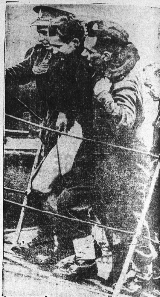
This wounded survivor of the Bismarck, German cruiser sunk by British salvos and torpedoes, apparently festers his trousers as the largest ship of the enemy navy was "cleared out". He was one of the 100 or so survivors picked up out of a crew of 2,300.