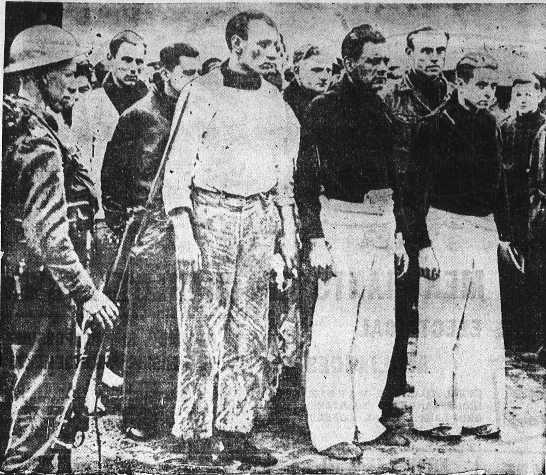
Apparently scared stiff by their close call, this group of survivors from the Bismarck show no expression as they await their fate after landing in England. A Canada-bound transport liner dodged the Bismarck after being warned by an accompanying destroyer to increase its speed.