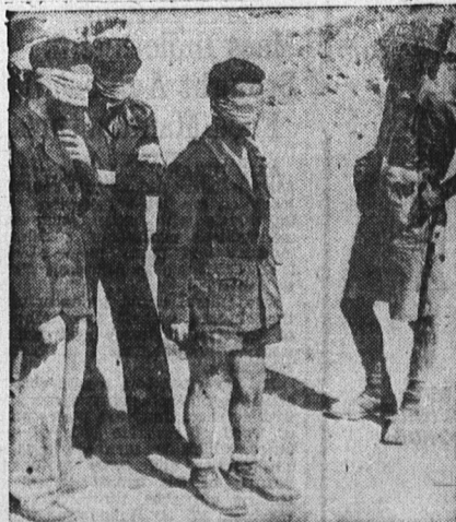
DARK FUTURE—Like participants in a grim game of blind-man's bluff, blindfolded Italian prisoners captured near Tobruk are brought to the beleaguered fortress for questioning.