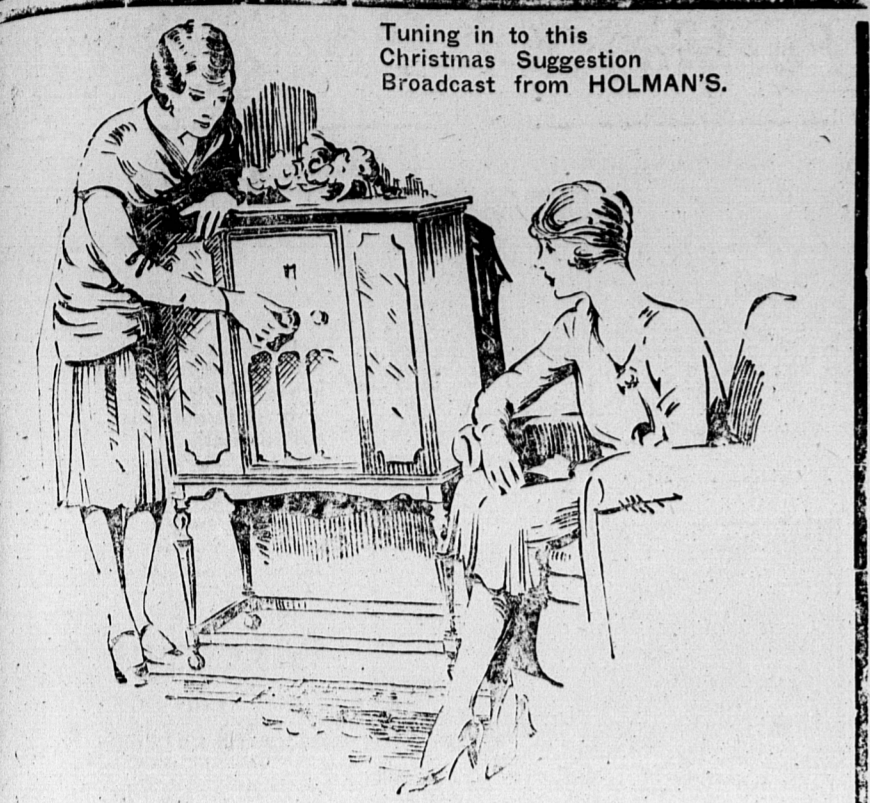
Tuning in to this Christmas Suggestion Broadcast from HOLMAN'S.