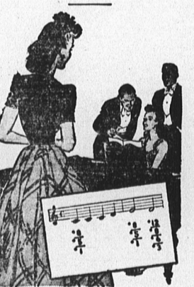
Chart a Quick Way to Learn the Piano

How To Join The Magic Circle? Not enough attention? One way to get attention is to deserve it! Playing the piano you always have admirers.