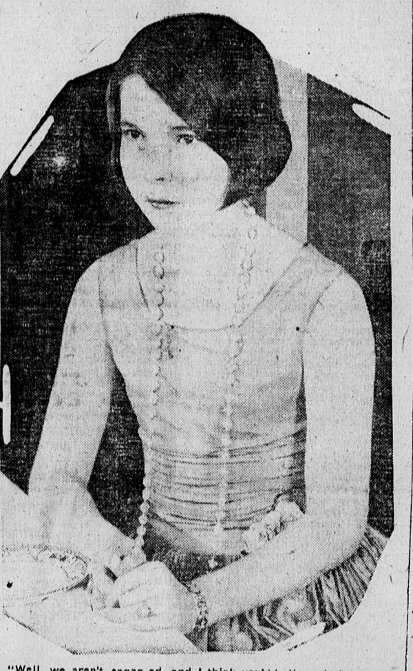
"Well, we aren't engaged, and I think you'd better mind your own business!"

maine made her quiver and ache with desire for the stimulus of his to brush them accidentally as he went cold and rigid with the pain of waiting, so that she dropped the tiny dish of salt. His lean brown fingers did brush hers then, as they scooped the spilled crystals from the cloth, and instantly she had the feeling that she had been given a dose of some powerful drug. Better fling some of that salt over your left shoulder, Billy, or you'll have bad luck," Winnie Shelton suggested sweetly, but her eyes were furious. She had seen the touch of Romaine's hands, "Oh, Dal—I mean Mr. Romaine, Winnie flattered, you haven't forgotten what you promised—for this afternoon?" Her coaxing voice hinted at lovely secrets. Romaine's grave, still face was max's cheeks and burned in her narrowed eyes. "I'm going to the Princess Shoppe for a fitting," she snapped. T. Q. chuckled. "I've meant to tell you girls that you are at liberty to bring any of your old friends to the house. Banning is the young chap who squired you at the anniversary party, isn't he, Nyda?" "Eddie Banning is nothing to me," Nyda's fingers trembled as she raised a fork of creamed chicken to her sullen mouth. "I haven't noticed Clyde, Stewart around here yet, Winnie," she added maliciously. "Clyde?" Winnie's eyes were very wide and innocent. "Why, Clyde Stewart and I were just friends, thrown together at the store, but I thought you and Eddie were engaged." "Well, we aren't engaged, and I think you'd better mind your own