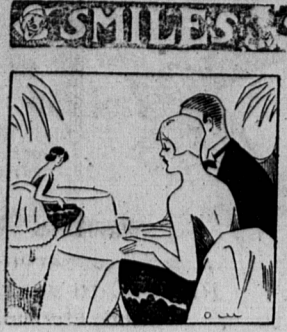
ONLY TO TALK ABOUT "Does she know Mrs. Jones well enough to talk to?" "No, only to talk about."