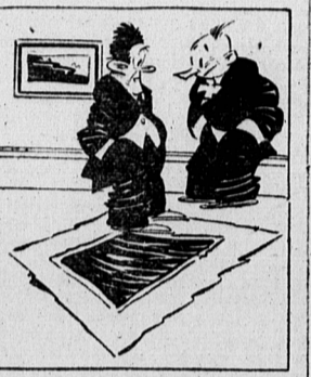
"I see the mathematicians won out in their contest with the philosophers. How'd they do it?" "Through numbers, of course."