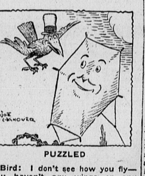
Bird: I don't see how you fly— you haven't any wings or any feathers!