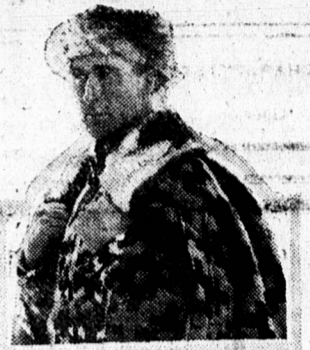
WILLIAM S. HART "Shark Munroe"

They called him "Shark" because he was bloodless and cold—a human icicle! but he melted under a woman's smile.