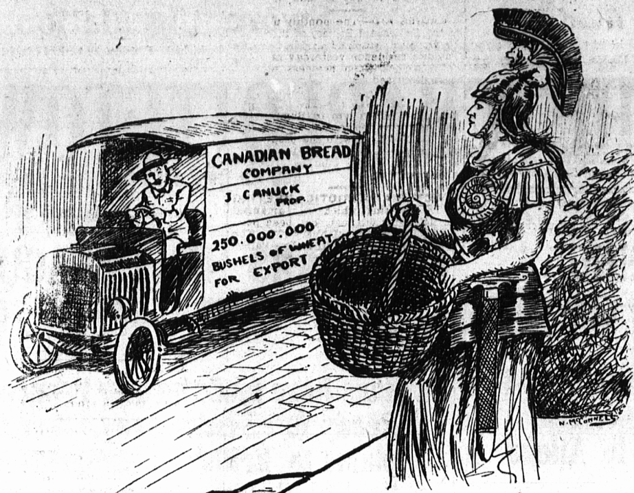
BRITANNIA: I'LL TAKE ALL YOU HAVE TO SELL MR. CANUCK.