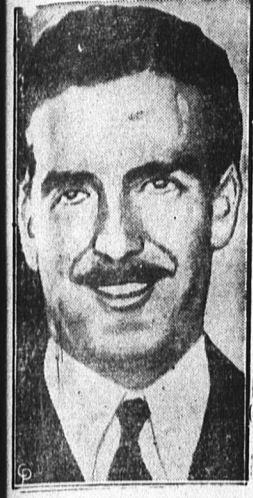
Foreign Secretary Anthony Eden, in a general outline of British war aims yesterday said "we must never forget that Germany is yet to be defeated."