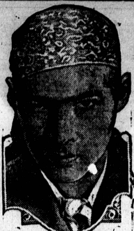
Rodolph Valentino in the Paramount Picture, 'Blood and Sand'

BLOOD AND SAND AT THE PRINCE EDWARD TODAY