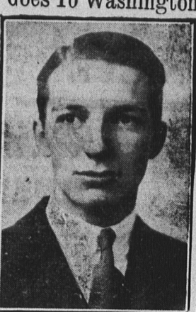
J. E. COYNE

Who has resigned from the staff of the Foreign Exchange Control Board to take up the duties of Financial Attaché to the Canadian Legation in Washington. A Rhodes Scholar from Manitoba in 1931, Mr. Coyne later graduated from Oxford University and was called to the Bar of Manitoba in 1934 after passing the final English Bar examinations with Honours. He practised law in Winnipeg until 1938, when he joined the staff of the Bank of Canada. He was Secretary of the Foreign Exchange Control Board from its inception until his recent appointment in Washington.