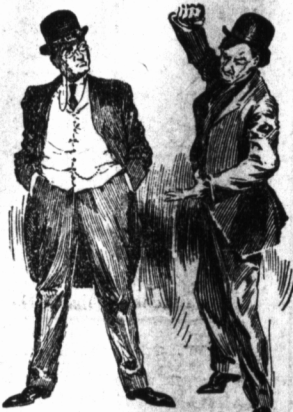
A CONVINCING ARGUMENT.

Common sense is just as necessary (even more so) in medicine as in business or the affairs of every day life. People are getting to know more than they used to. Not so long ago, it was the fashion to make all sorts of claims for a medicine, and wind up by asking the reader to go to a drug store and buy a bottle. People won't stand for that kind of thing now. They want to see a tangible proof. They want to try the remedy first and if they find to be what is claimed they will be glad enough to go and buy it.