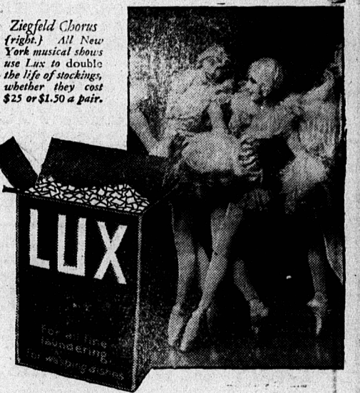
Ziegfeld Chorus (right.) All New York musical shows use Lux to double the life of stockings, whether they cost $25 or $1.50 a pair.

"MY stockings cost me $1.45 a pair and they never seemed to last any time at all! "One day I looked over the ruins of half a dozen pairs. I was so tired of having only one good pair to my name! How I longed to have six pairs in my stocking box all in good condition. "But my stockings wore out so fast it left me poor just replacing worn-out ones. "Then I happened to read how the big New York musical shows keep their stockings just like new twice as long with Lux. "I determined to try it myself. "I've actually done just what these shows do—I make my stockings wear twice as long by always washing them in Lux. Now my stocking money buys extra pairs instead of just replacing worn-outs. I've got several good pairs of the latest shades all the time and I don't spend a cent more!" Give your stockings this marvelous Lux care that doubles wear : : : make your stocking money go twice as far!