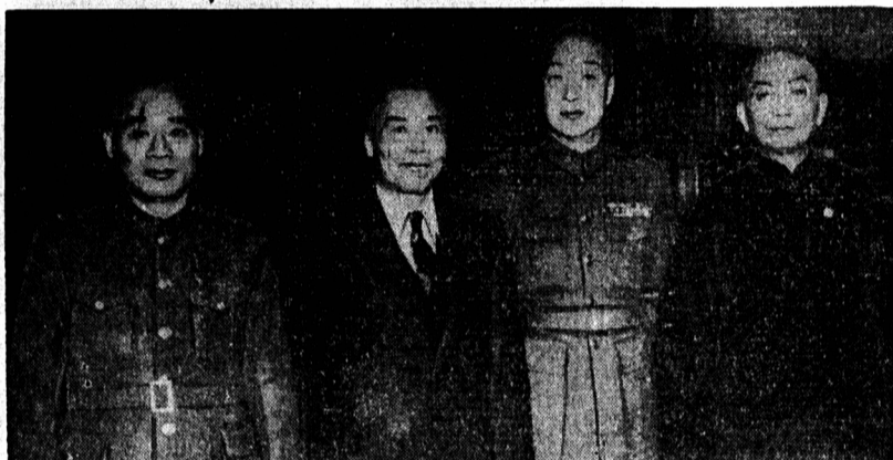
Acting President Li Tsung-Jen, who assumed presidential duties when Chiang Kai-shek relinquished the reins in National China, is shown with members of the Nationalist high echelon shortly after he took office in Nanking. Li immediately appointed a peace commission to negotiate with the Communists with a view to bringing about a cease fire and opening of peace talks.