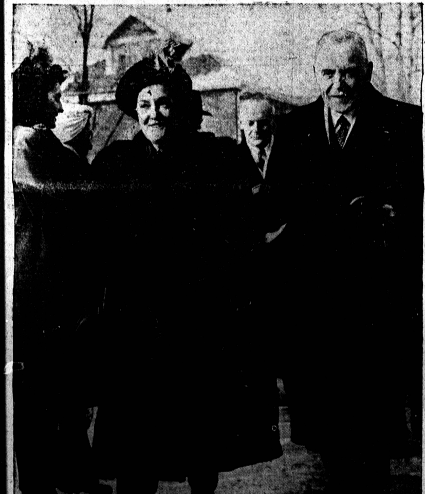
Welland's third visit by a Prime Minister is recorded as Mr. and Mrs. St. Laurent move through the crowd which greeted them at mass at Sacred Heart church. Other premier visitors were Sir Wilfrid Laurier, 1896, Sir John A. Macdonald, 1888.