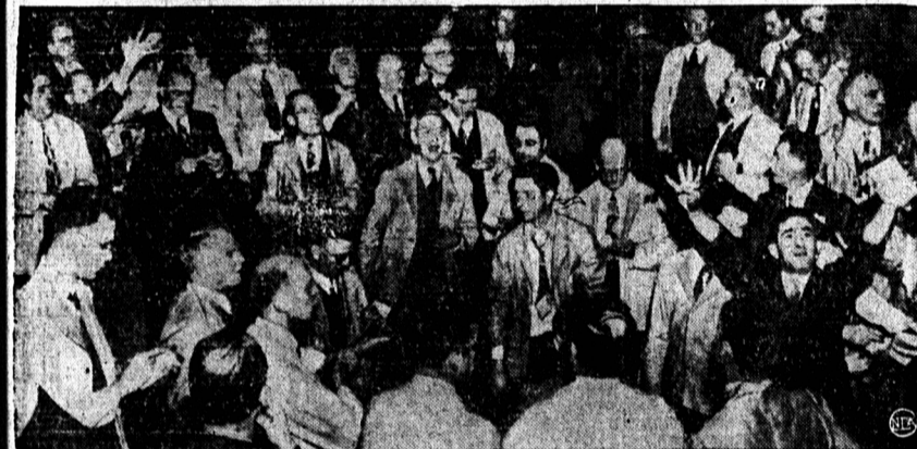
About as confused as this picture was the trading on the floor of the Chicago corn pit, where the camera recorded traders in the midst of their hand-signals during a widely fluctuating session. Jitters were soothed somewhat after the government moved in on the grain market to fill foreign commitments.