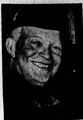
President Truman has disclosed that General Eisenhower has been recalled to his country's service as chairman of the United States joint chiefs of staff. Washington gave no inkling of any new critical turn in world events in connection with the appointment. Officials said one of Eisenhower's chief tasks will centre on ending the old feud among the army, navy and air force. Eisenhower left the service early in 1948 to become president of Columbia University, in which capacity he is seen above. He has been given temporary leave of absence from there.