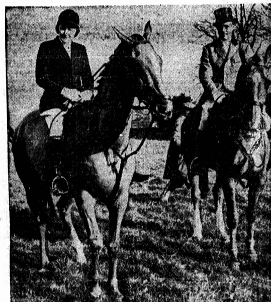
The Huntsman's horn sounded and British royalty took to the trails in a special hunt staged to honor Prince Bernhard, consort of Queen Juliana of the Netherlands who is in England on a visit. Starting out on the Beaufort hunt with the Prince is the Duchess of Norfolk, one of Britain's leading peeresses. While in Britain Prince Bernhard is staying with the Duke of Beaufort.