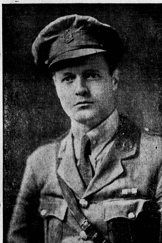
HON. DR. R. J. MANION, M. C. Leader National Government Party