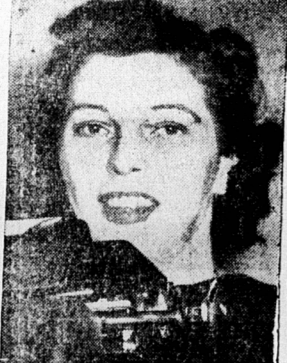
WORLD CHAMPION TYPIST

For a really bad case of sunburn, however, call a doctor. Now, to get back to the fascinating array of sunburn preventives