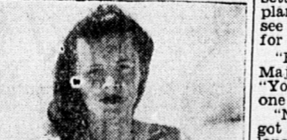
TO MARRY HENRY FORD 2ND

Crush thoroughly or grind about 1-2 quarts each lilly ripe strawberries and raspberries. Combine fruits; place in jelly cloth or bag and squeeze out juice. Measure 7-8 cups sugar and 4 cups juice into large saucepan and mix. Bring to a full rolling boil over hottest fire and boil hard 2 minutes, stirring constantly. Then add 1 bottle fruit pectin, being again to a full rolling boil and boil hard 1-2 minutes. Remove from fire, skim, pour and paraffin.