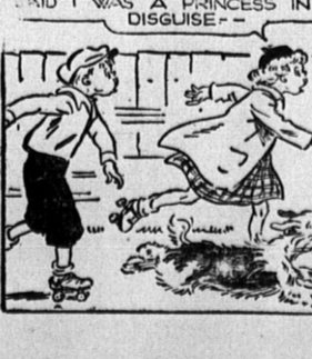
THIMBLE THEATRE--STARRING POPEYE