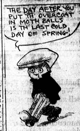
THE DAY AFTER YOU PUT ON OVERCOAT IN MOTH BALLS IS TH LAST COLD DAY OF SPRING!