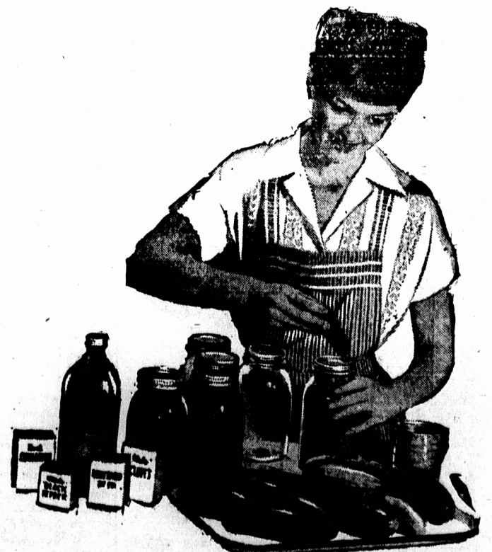
Preparing An Exhibit

The Women's Institutes are taking a special interest in our Exhibition and will occupy the entire Show Building with exhibits of handcraft and home-made baking. There will be a special display of flowers and several attractive booths—Be sure and visit the Show Building and see what the Women's Institutes can do when they get behind a worthy object.