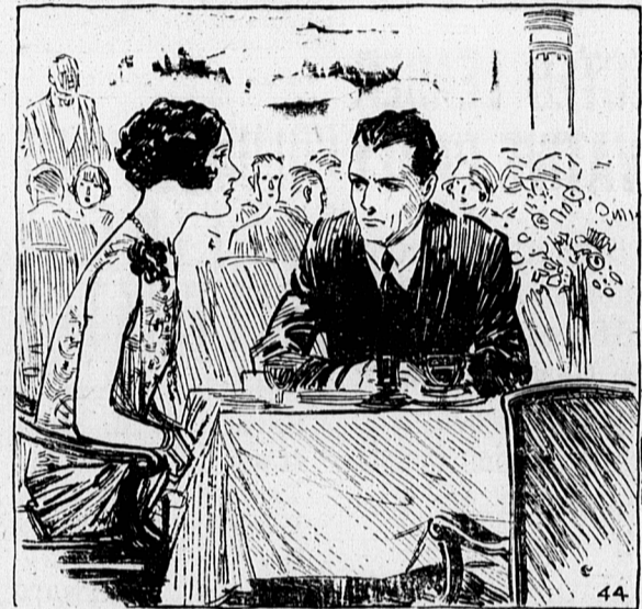
"I say, what's this about Phil's disappearance?"

So, when King Carson, distinctly puzzled, asked: "But what made you cut loose and beat it for the beach in the middle of the night?" she replied evasively: "I was greatly troubled over—over something,