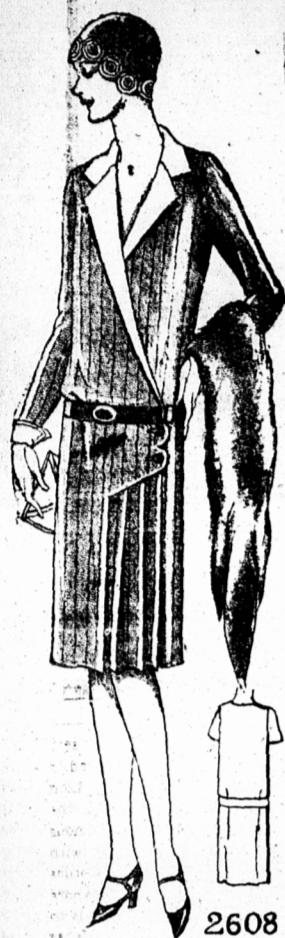
A sheer woolen in new yellow

brown and white combination that expresses effective simplicity in its soft tailored lines.