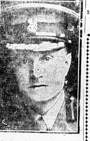
Sir Samuel Hoare, British Air Minister, who predicts big strides in Empire aviation development as result of Imperial Conference discussion.