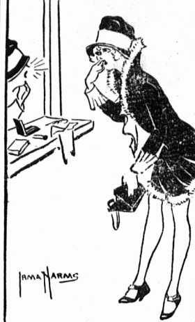
The lost compact produces a shining example of carelessness.