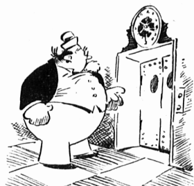
Farmer (watching elevator indicator): Gosh! How time does fly here in the city!