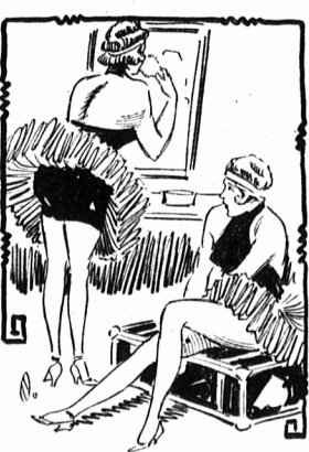
GETTING THE BREAKS "I, at wealthy old coddger that Mabel married died this morning." "Aw gee! Some girls is lucky."

ECZEMA IN RASH ON HANDS Troubled For Three Years. Healed by Cuticura.