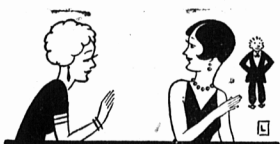
POISONOUS CHARACTER "Have nothing to do with him—he's a perfectly poisonous character."