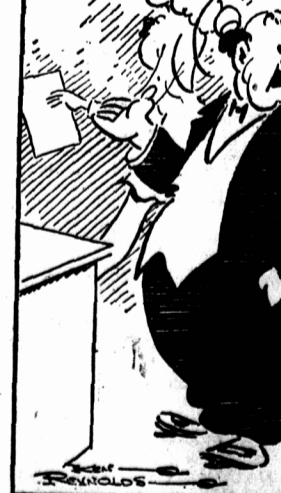
"Sure she's capable! When she answered our Guardian Want Ad she said her last employer said she was capable of anything!"