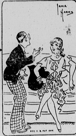
"A chatter wouldn't sound so flat if he had a little more chatter flatter."