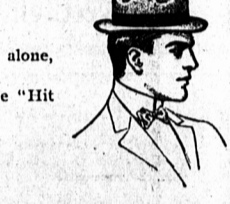
$2 50 $3 00