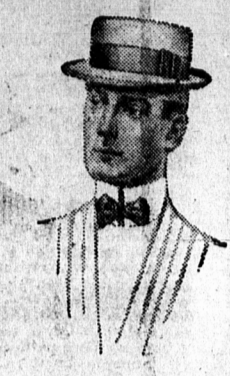
$2 00, $2 50 and $3 00

Nowhere can money be better hats. I have yet to facet he head cannot fit.