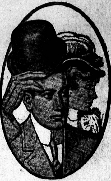
Franklin Hats $3 00

Easter Hats Come to the only exclusive Up-To-Date Hatter for your Easter Hat. Easter Hats