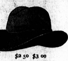
$2 50 $3 00